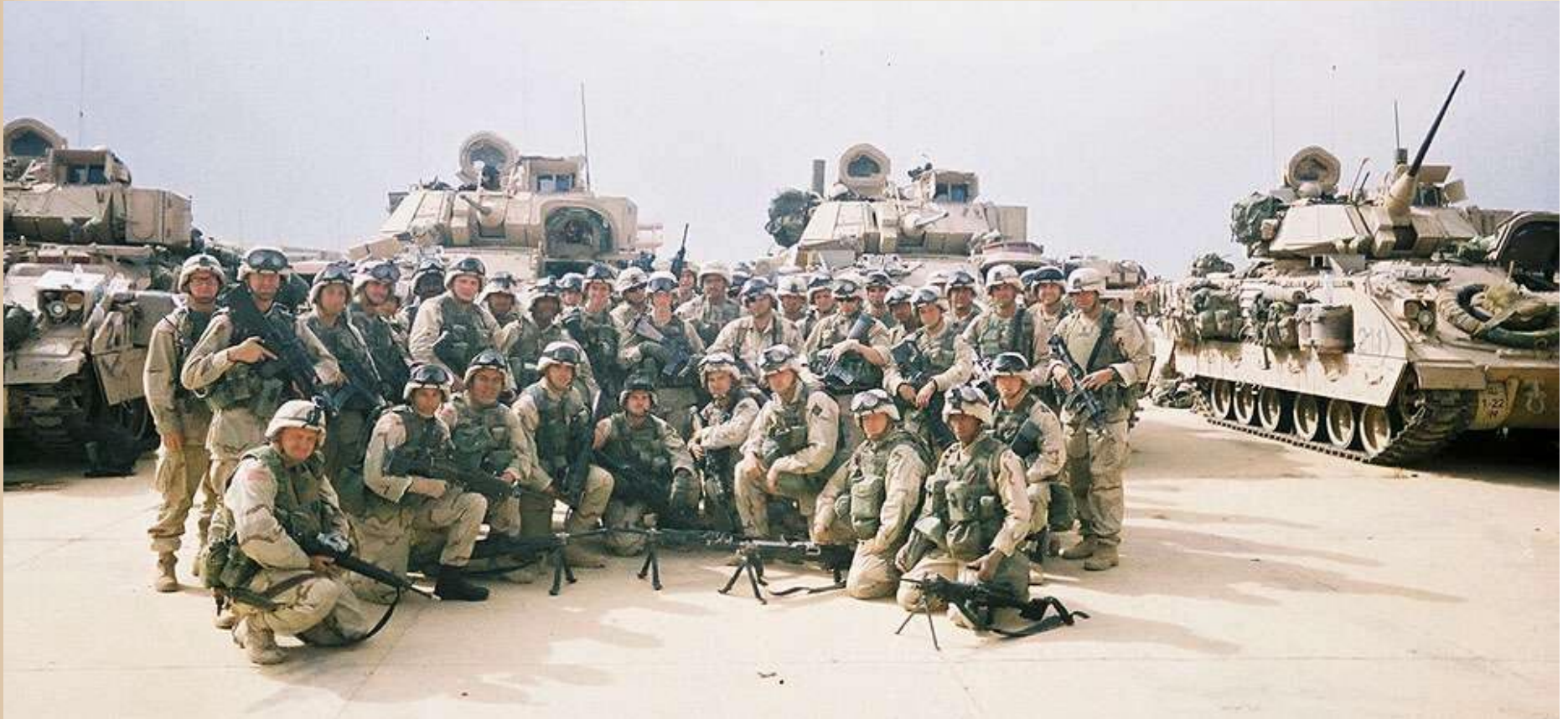
A Mechanized Infantry Platoon